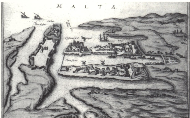
Map drawn after the Great Siege of Malta (1565), showing the fortifications of the Great Harbor and the construction of the new city of Valletta. Georg Braun & Fran Hogenberg, mapmakers, ca. 1600.

The lecture is free and open to the public