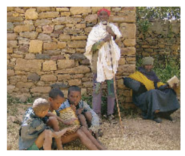
Boys in Yeha, Tigray Province, northern Ethiopia, learn to read the ancient language of the Ethiopian Church, Ge'ez, by reading from a manuscript.

Despite the successes, events eventually overwhelmed the project. In 1978, rising government opposition to international partnerships led to the resignation of EMML's Ethiopian director. Project management passed to the Ethiopian Ministry of Culture. Work continued off and on until 1991. Communication with HMML was intermittent and many films were never copied. By 1992, the very location of the EMML collection, including almost 1000 uncopied microfilms, was unknown.