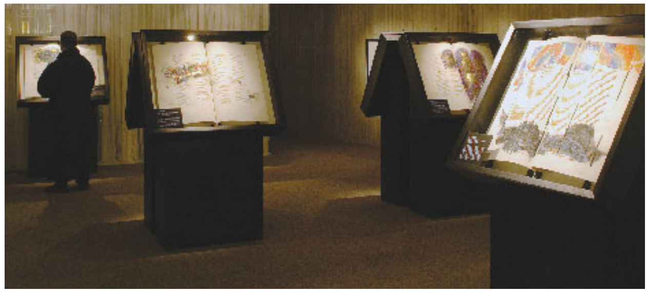
The Prophets: Word and Image exhibit at HMML.

Word and Image features pages from Prophets, the fourth completed volume of The Saint John's Bible . Among the pages on view are Ezekiel's Vision of