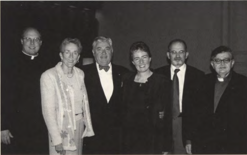
Celebration of Malta Day in Minnesota - 30 September 2000