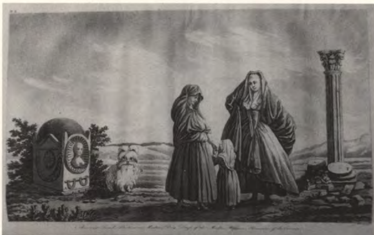
Maltese women wearing faldettas and a Maltese dog, from Louis de Boisgelin, Ancient and Modern Malta . 2 volumes (London, 1805).