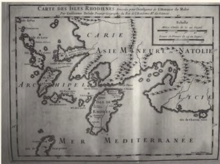
Carte des Isles Rhodiennes, from L'Abbe de Vertot, The History of the Knights of Malta (London, 1728)

took to resist them. He writes one of the earliest descriptions of a civilian population enduring gunpowder bombardment. He makes clear that the Knights achieved success through superior military planning and through the cooperation of the civilian population. Since some of the translations attributed the conclusion of the siege to divine intervention, possession of the original Latin text gives important insight into the original thoughts and motivations of the Knights.