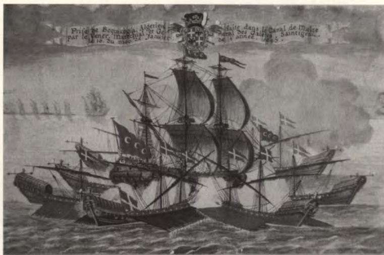
Taking of the Bequicogia galleys of the Order, 16 January 1647. (Watercolor in the collection of the Malta Study Center.)

The Malta Study Center is one of the few libraries in the United States that actively collects books and other works on paper pertaining to the history of Malta and of the Knights of Malta. Recently, the Center displayed some of its treasures as part of the Malta Day celebrations at HMML. Exhibit highlights included: